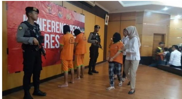
Figure 1: Negative punishment for the impact of the marriage contract